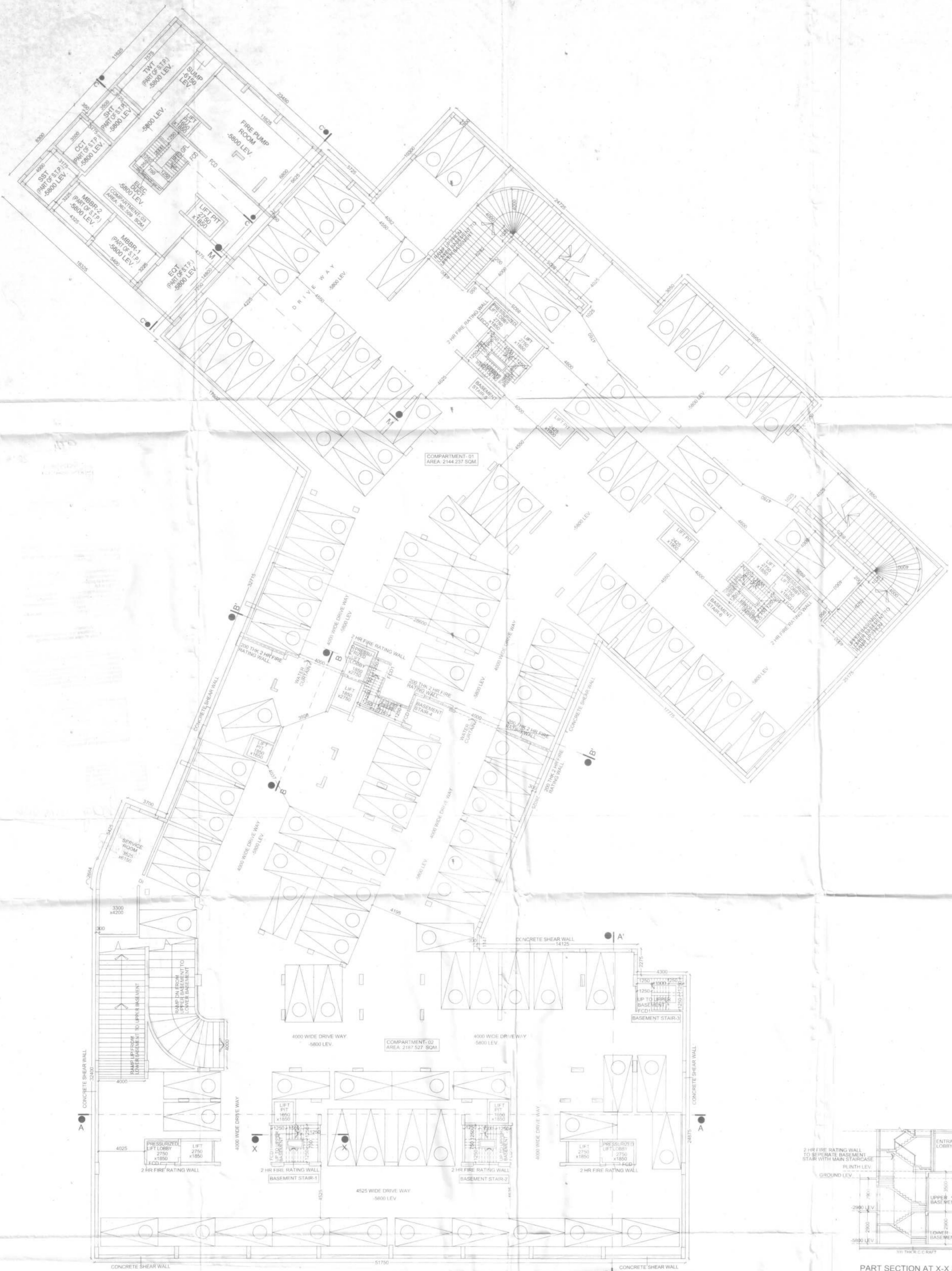
LOWER BASEMENT PLAN- 111 nos of car (UNDER TOWER- 1, 2, 4 & PART OF 3) SCALE- 1:125